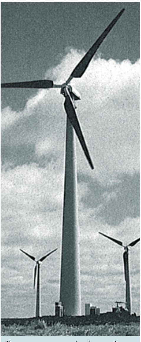
Farmers can earn extra income by leasing land for wind power plants, such as this one on Buffalo Ridge in southwest Minnesota.

his return on the land "anywhere from 30% to over 100%."