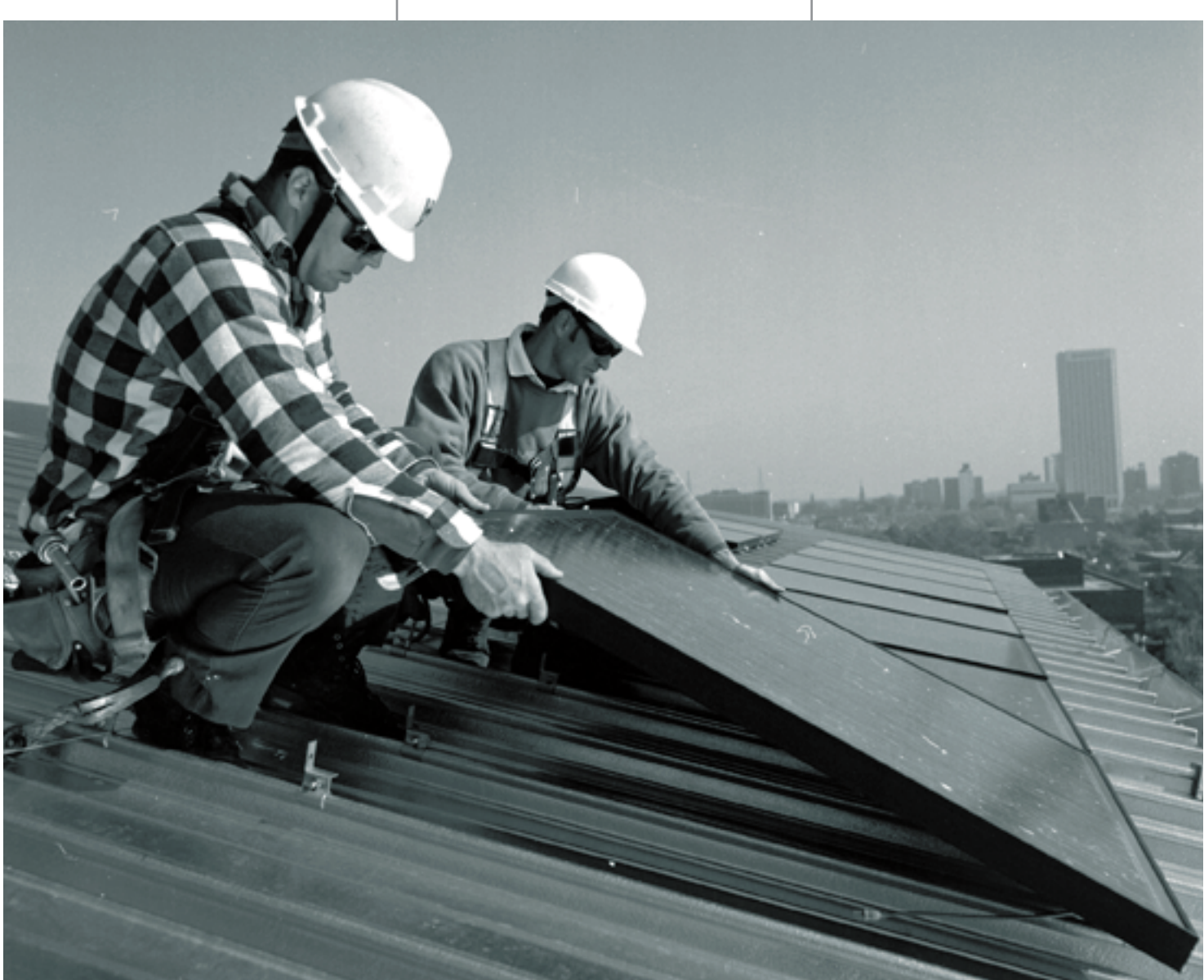
The U.S. PV industry employs 15,000 people, most of them in high-quality jobs, including installation, servicing, and maintenance. This 340-kW system was installed on the roof of the aquatic center for the 1996 Summer Games in Atlanta, Georgia. It is the world's largest building-integrated, rooftop PV system.

Another PV manufacturer, Atlantis Solar Systems/Solar Building Systems, also took advantage of Virginia's incentives; Atlantis is constructing a production facility in Cape Charles that will create 25 jobs.