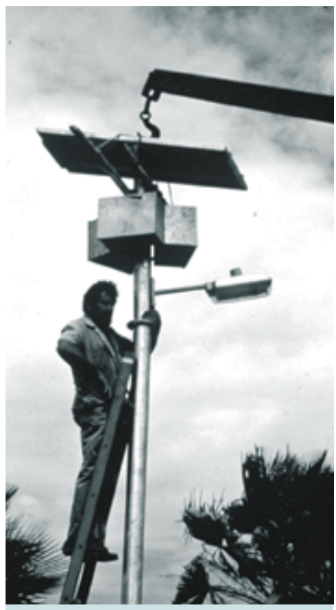
Worker installing a gridindependent, PV-powered street light.

The lines provide little revenue. About half of the association's customers use the electricity primarily to power small irrigation pumps. In 1990, KC Electric began using photovoltaics as a more practical and affordable alternative to replacing damaged distribution lines serving remote livestock wells or extending lines to new well sites. The cooperative can provide PV-powered water pumping at a cost of $1800 to $6000 per well saving its members thousands of dollars when compared with the cost of providing grid electricity.