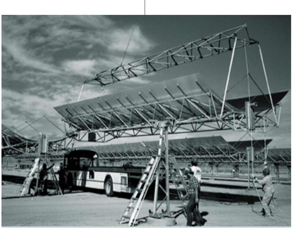
The assembly system used by Luz International for its parabolic-trough generating plants.