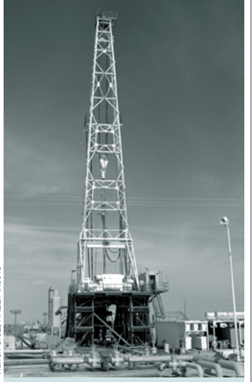
Geothermal production well at Imperial Valley, California.

producing power on federal lands in Nevada — half of these revenues are returned to the state.