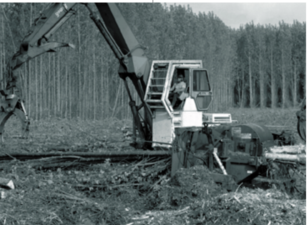
The biomass power industry creates thousands of jobs in fuel production and harvesting for rural workers, such as this grapple operator on a tree farm in

Maine obtains a greater percentage of its electricity from nonhydro renewable sources than any other state. The biomass power industry generates