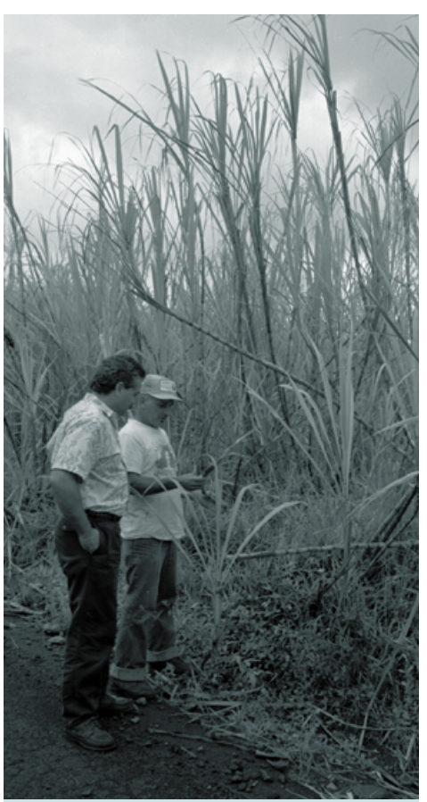
Most agricultural wastes can be used to generate electricity, including the mountains of fibrous material left over from processing sugarcane crops such as this one in Hawaii. Selling power to electric utilities helps to improve the economics of sugar production for local companies.

To expand power production from biomass substantially beyond current levels will require the cultivation of dedicated energy crops. New York has become the focus for a new initiative to develop agricultural feedstocks for energy production. This should help to stabilize the revenue stream for participating farmers: 26 area farmers have expressed a desire to diversify their crop production to include energy feedstocks.