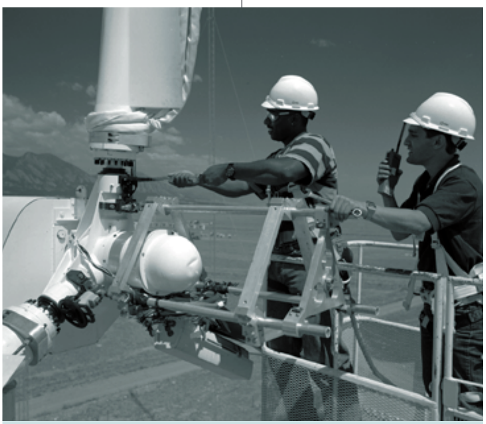
The wind industry pays more than $31 million each year in salaries to its employees. Most jobs in the industry are related to operating and maintaining existing wind power plants.