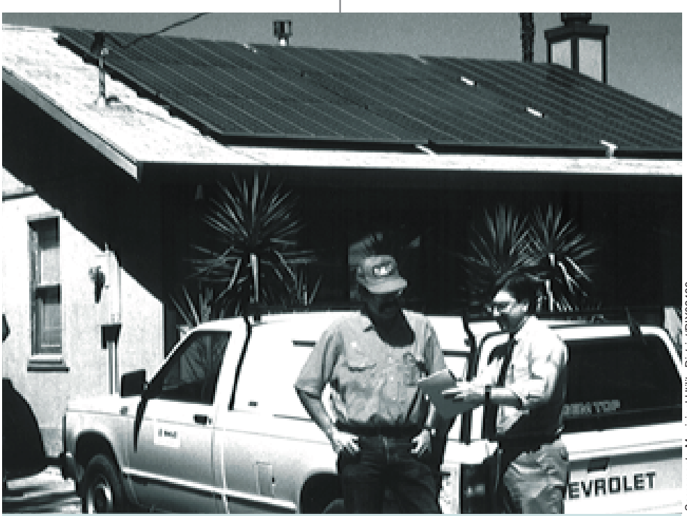
Through its PV Pioneers program, the Sacramento Municipal Utility District (SMUD) installs and operates grid-connected, rooftop PV systems on customers' homes. The program creates jobs in the utility's service area and reduces the need for SMUD to purchase electricity from other regions.

International sales continue to drive the PV industry. The largest market for photovoltaics is in the developing world, where two billion people still do not have electricity in their homes. Photovoltaic systems are particularly well suited to this market because of their high reliability, their suitability for applications of almost any size, and the fact that they do not need costly transmission lines. Approximately 70% of U.S. photovoltaic manufacturing output is exported.